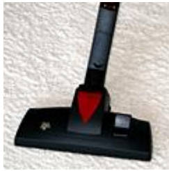
Clean with space dust sensor