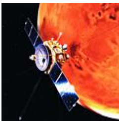
Dust detector on Japanese Nozomi