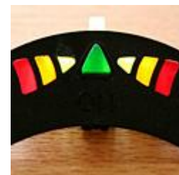
Green light for dust-free

Mounted in the vacuum cleaner manifold, his sensor checks the amount of dust passing. 'Traffic lights' on the nozzle show red for 'still too much dust', orange for 'medium', yellow for 'slightly' and green for 'no more dust'.